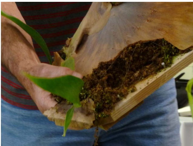
Removing a Platycerium Pup